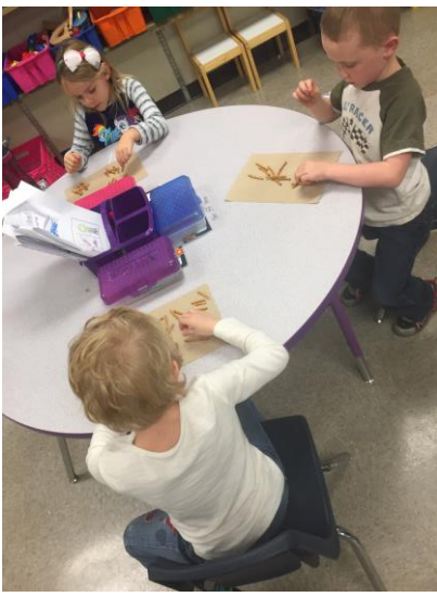
Kindergarten: Students use pretzels to learn about tally marks