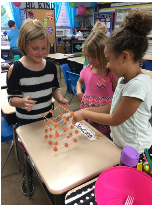
Third Grade: Students became engineers and built a structure out of Halloween candy.