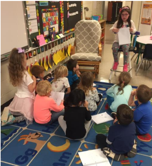
Kindergarten: Students wrote about shapes and presented it to their class.